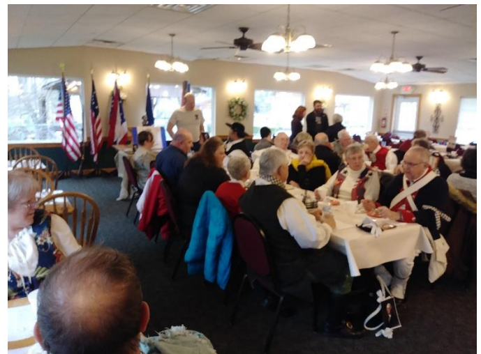
Photo Three: The annual Washington's Birthday Luncheon was held at the Old Dutchman Restaurant in Logan with a nice turnout on February 17th.